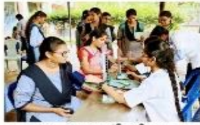
వైద్య శిబిరంలో పరీక్షలు

దేవీచోట: రాజమహేంద్రవరం ప్రభుత్వ ఆర్ట్స్ కళాశాల మహిళా సాధికార విభాగం, యూజీ రెవల్యూషన్ ఆధ్వర్యంలో రోటరీ క్లబ్ రాజమహేంద్రవరం రివర్ సిటీ, జీఎస్ఎల్ ట్రస్ట్ క్యాన్సర్ అనుపత్రి సహకారంతో