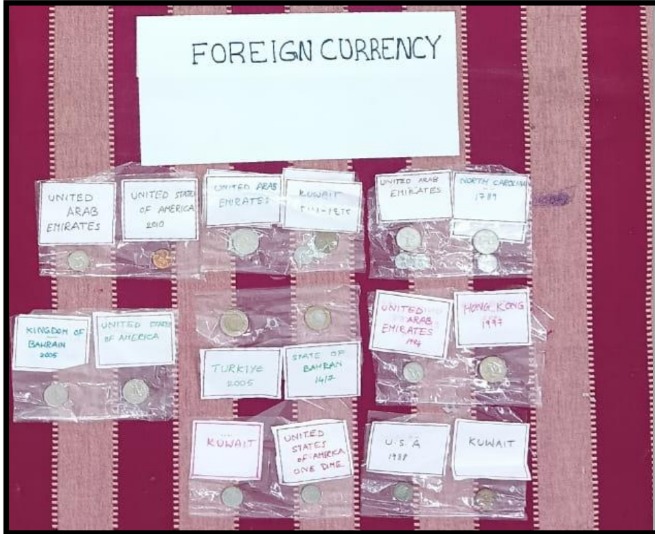
Fig 1.b: Collection of Foreign Currency

AFFILIATED TO ADIKAVI NANNAYA UNIVERSITY