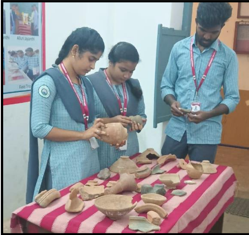
Fig 2.a: Students analyzing the ancient artifacts