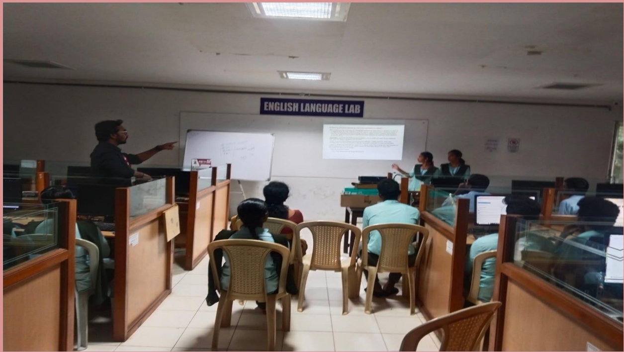
SESSION 4 BY V KALYANI & S LAKSHMI OF II STAT HONS STUDENTS