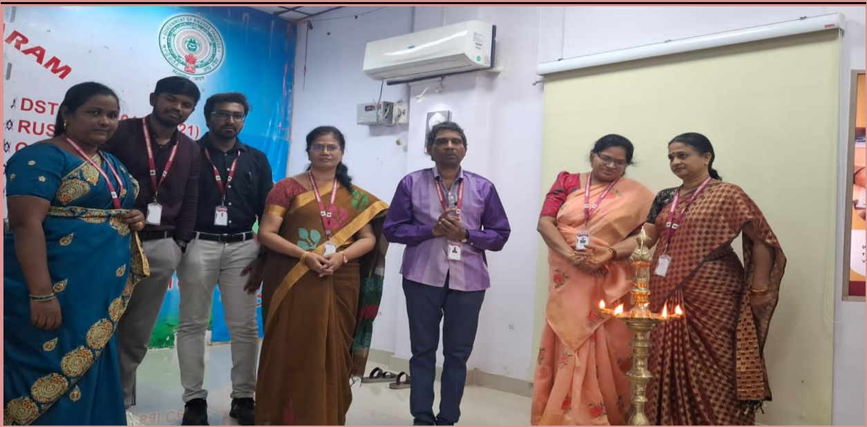
LIGHTENING LAMP BY HONORABLE GUESTS AND DEPARTMENT FACULTY MEMBERS