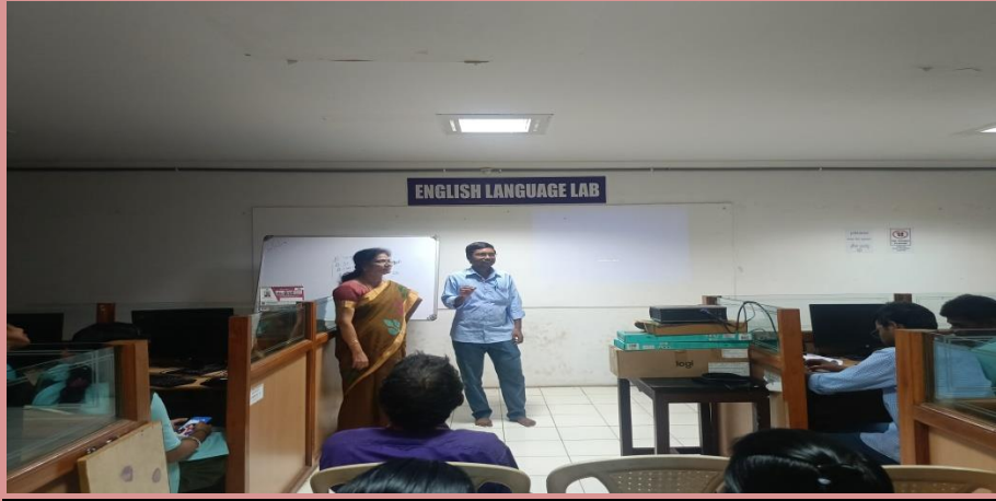
SESSION 6 BY G SATYAPRASAD & K RAVITEJA OF III MSDS STUDENT