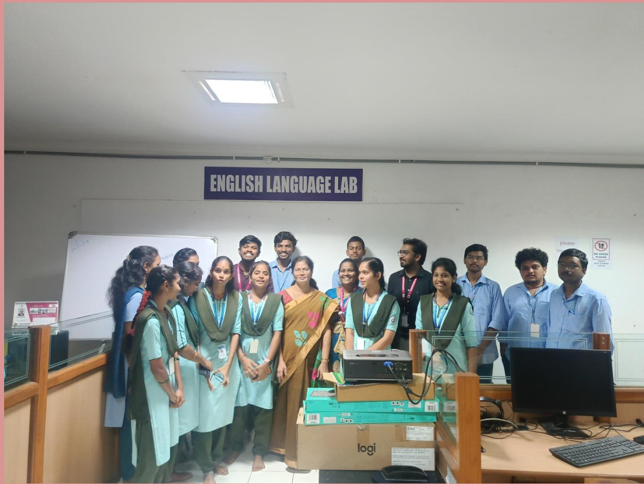
WORKSHOP ORGANSING STATISTICS STUDENTS TEAM AND DEPARTMENT OF STATISTICS FACULTY MEMBERS