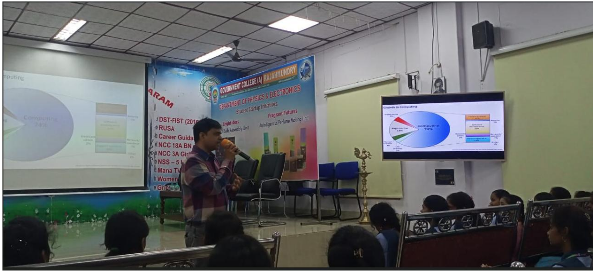
Resource Person from Ah carrer