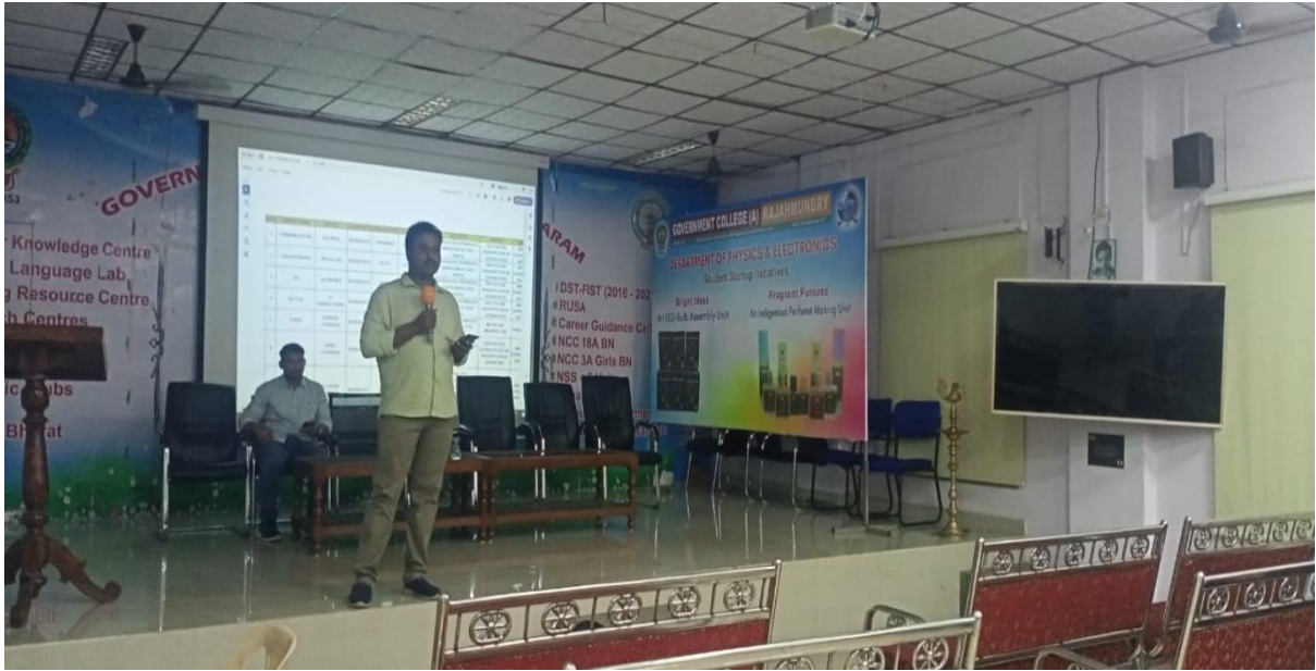
Resource person from Anjana Foudation