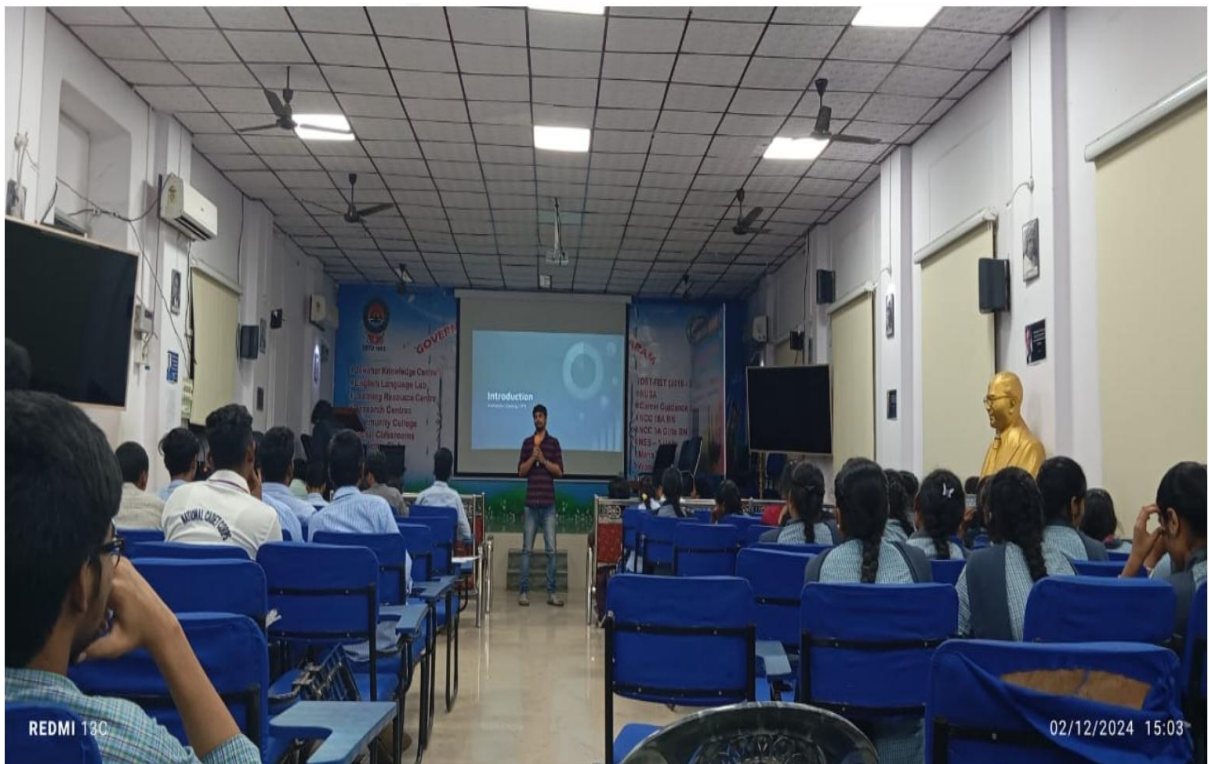
Resource person from Jeevachitram LLP