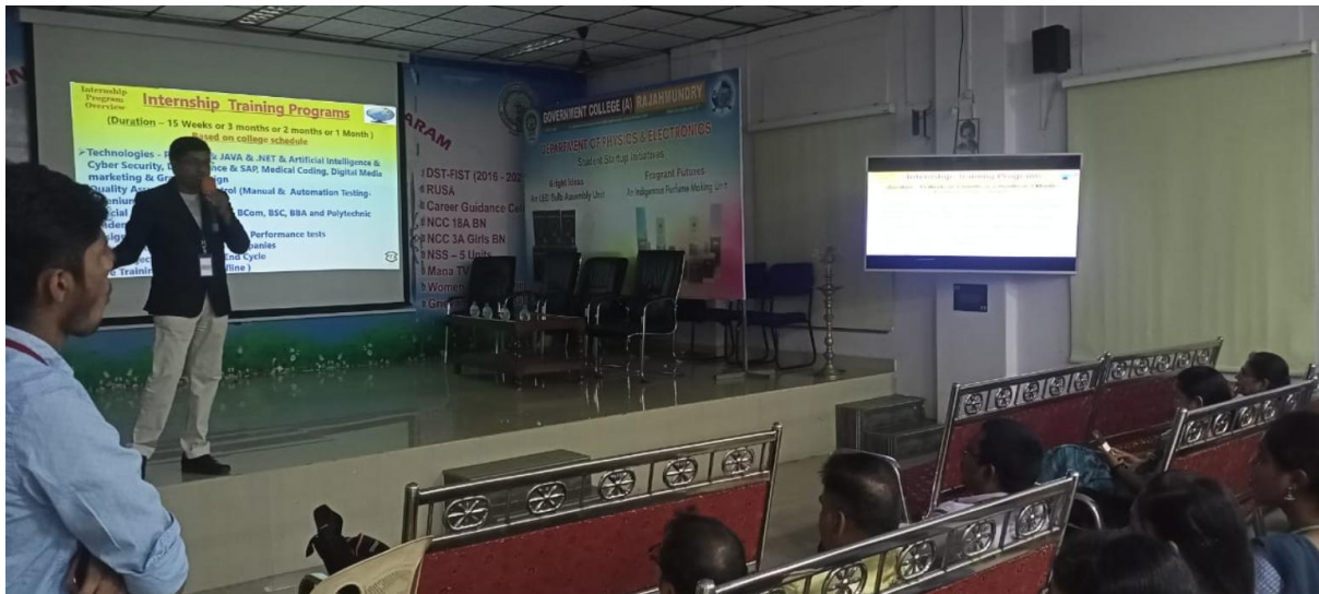
Resource person from Franqline Technology