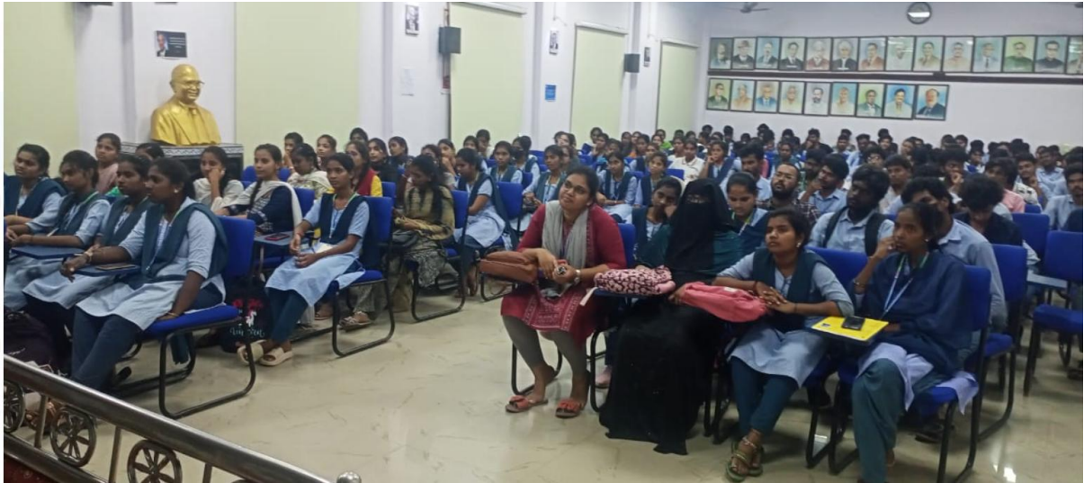
Students interacting with resource persons