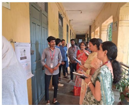
Vizesh explaining the revolutionary development of Metal-Organic Frameworks (MOFs)