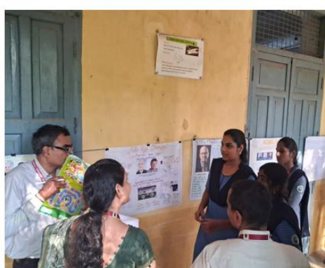
Students explaining Development of Asymmetric Organocatalysis .