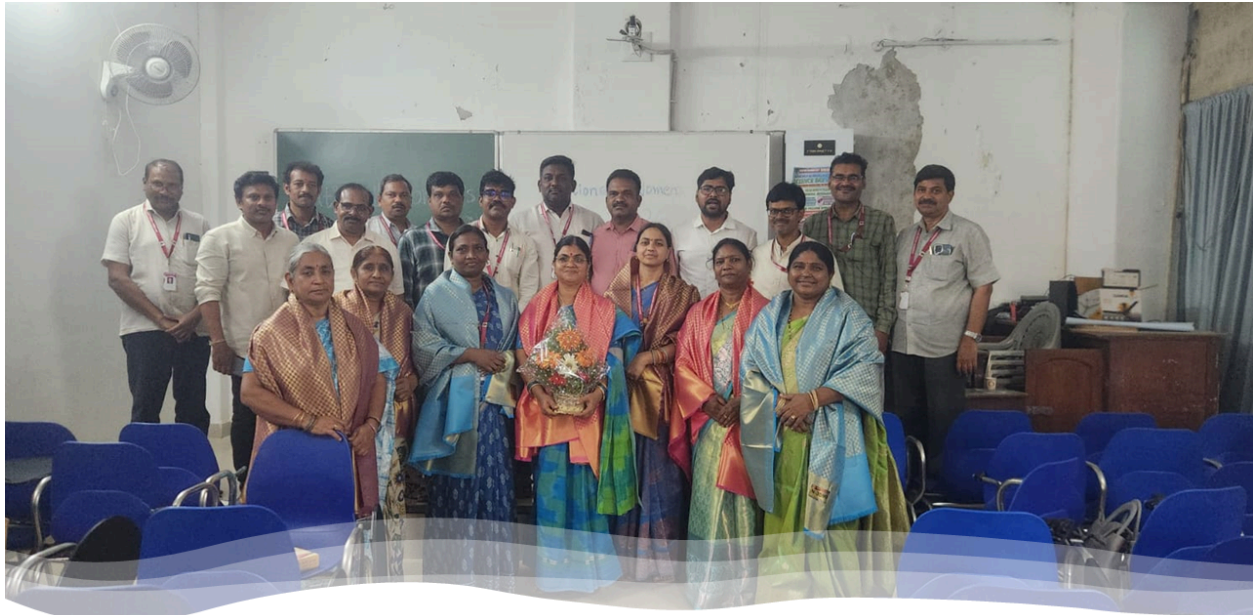
National Women's Day celebrations in the Department of Physics