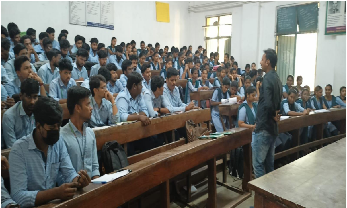
Interaction with Final Year Students by Technical Team